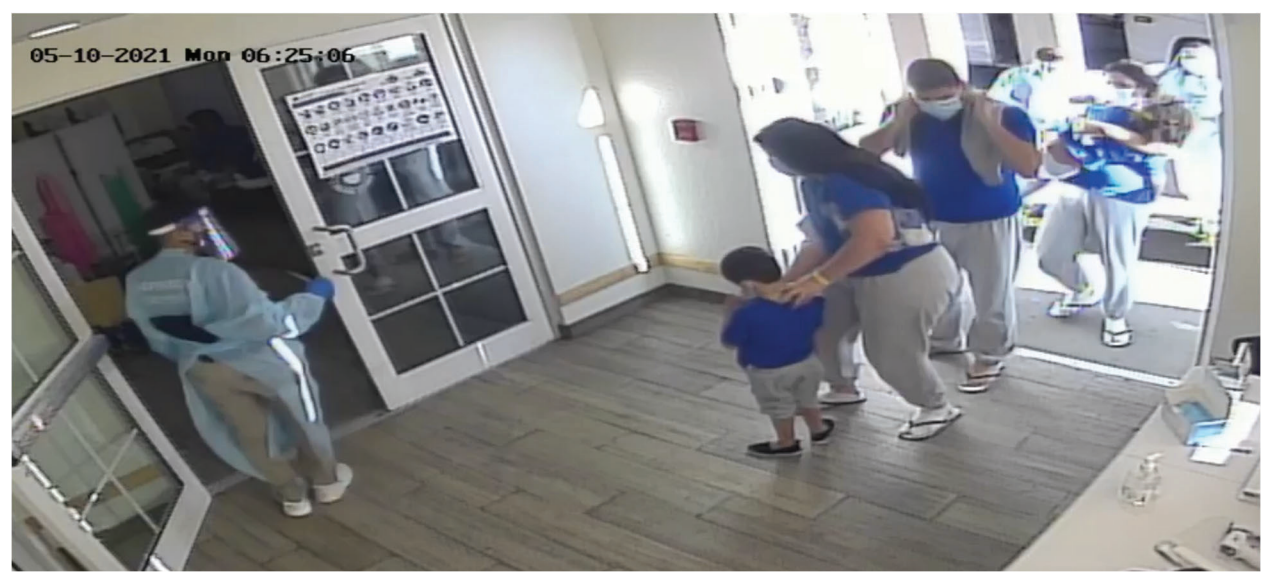
Figure 4. Migrants arriving at an ICE hotel in El Paso, Texas, in May 2021.