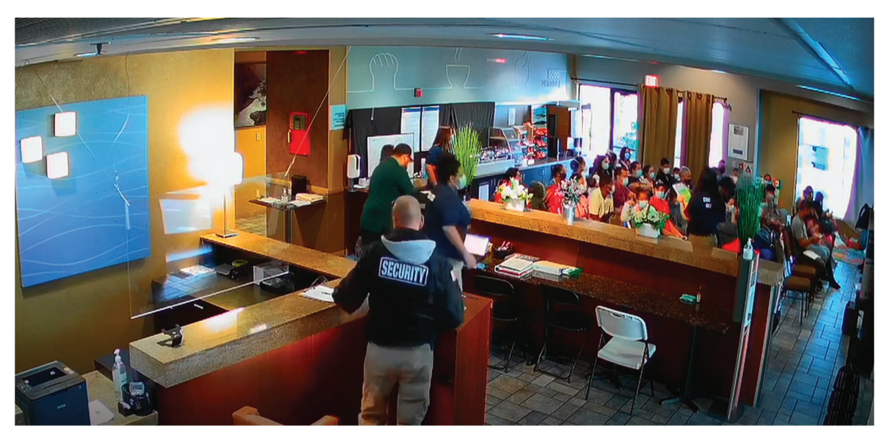
Figure 2. Migrants waiting to be processed at an ICE hotel in Phoenix, Arizona, in May 2021.

In March 2021, ICE modified its FRS<sup>8</sup> to establish guidelines for housing and caring for migrant families held in ICE custody at hotel locations operated by Endeavors, as pictured in Figure 2. The standards were customized for hotel locations to reflect that hotels are not intended to provide long-term residential care. The modified FRS kept some of the required standards intact but modified or removed several key standards that were not useful or appropriate for short-term stays.<sup>9</sup>